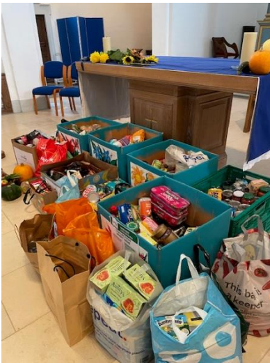
Donations at Harvest Festival supported by the whole community in support of West Berks Foodbank.